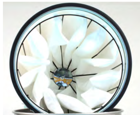
Star Shaped Polyester Main Filter