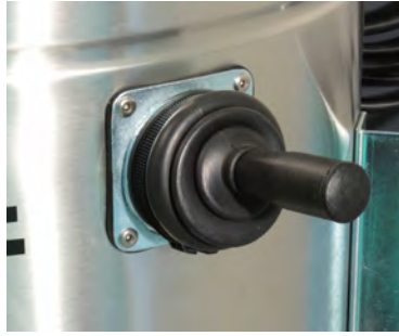
Side Mounted Manual Filter Shaker (external view)