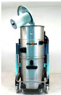
Standard filter cartridge. Optional HEPA cartridge available