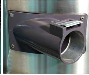
Tangential Suction Inlet, 70mm, made of Aluminum