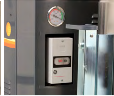
Filter Blockage Indicator Gage. Manual Starter with Overload Protection.