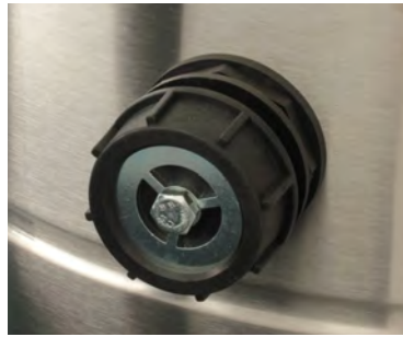
Vacuum Relief Valve