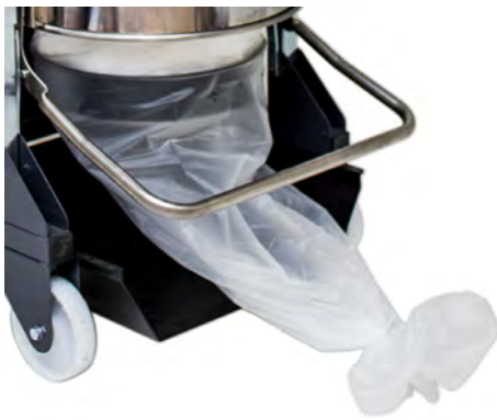
Longopac® "endless" collection system