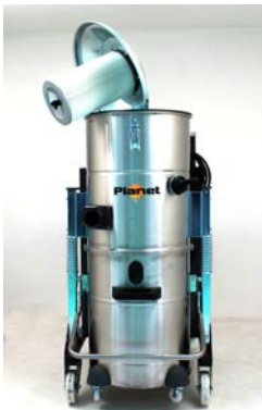
Upstream HEPA Filter included. 99.97% efficiency on 0.3 micron