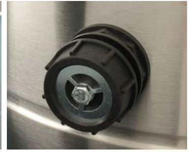
Vacuum Relief Valve