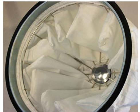
Star Shaped main filter made of conductive material