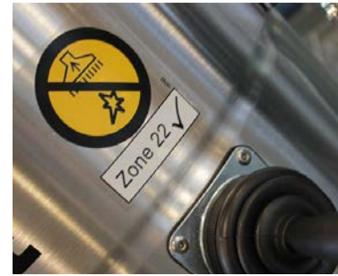
Side Mounted Manual Filter Shaker (external view)