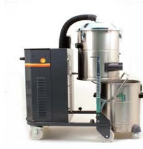
Detachable Recovery Tank (side view)