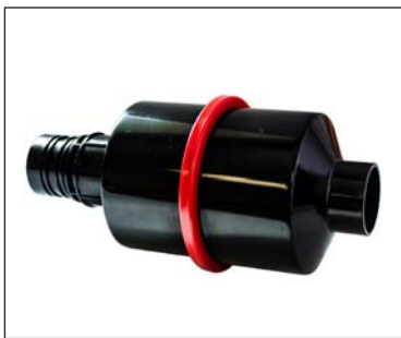
Detachable Exhaust Silencer