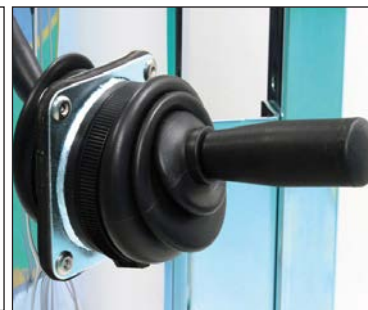
Side Mounted Manual Filter Shaker (external view)