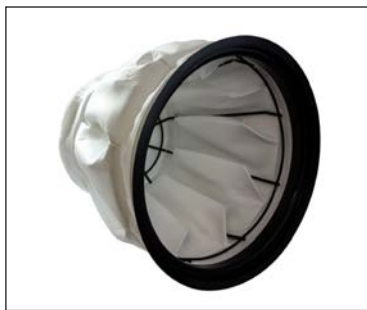
Star Shaped Polyester Main Filter